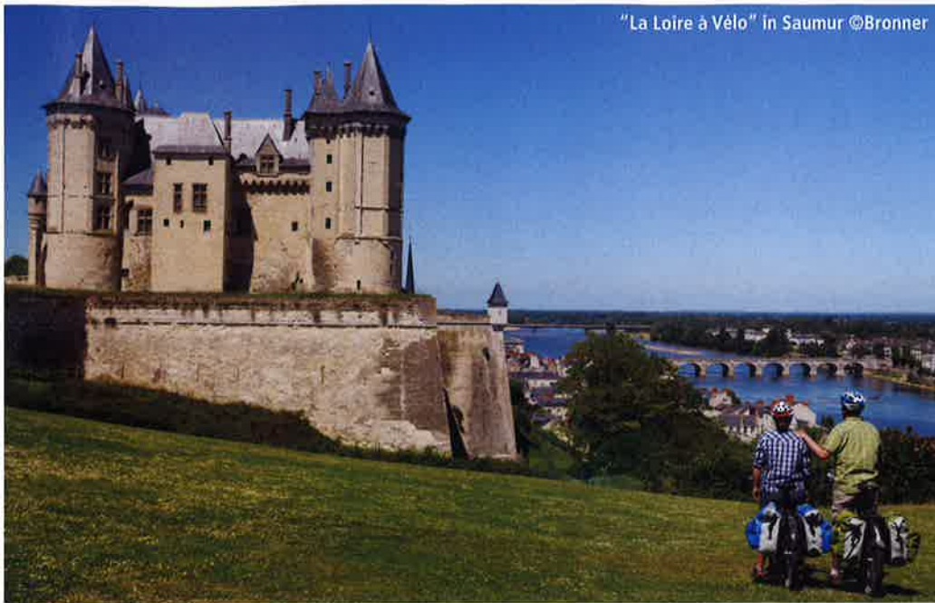
"La Loire à Vélo" in Saumur