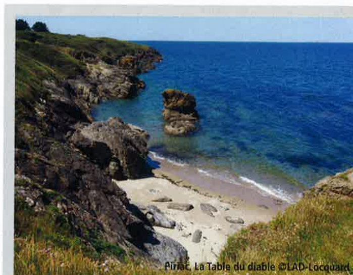
Piriac, La Table du diable

On the isle of Nantes are the intriguing Machines de l'île, with the Great Elephant and the Marine Worlds Carousel (rewarded this year for the best Art installation in the world) plus the Memorial to the Abolition of Slavery. From June 27th to August 31st, discover the poetic side of the city through its 10-mile circuit. During this event, "art will turn the town upside down", just follow "the green line" in the streets, international artists will exhibit their work.