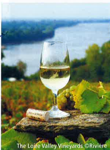
The Loire Valley Vineyards

Enjoy peaceful vineyards that benefit from the proximity of the Atlantic ocean and the river Loire. The gentle climate is another advantage enjoyed by the Vignoble Nantais (Nantes Vineyard region). Covering some 30,000 acres/12,000 ha, this is the cradle of the famous Muscadet wine. To soak in the flavours of the region, tasting stops are recommended. The cuisine is based on fish, seafood and vegetables from Loire-Atlantique, all laced with Muscadet – not forgetting the sweet delights of crêpes with salty butter, the Gâteau Nantais, niches of La Baule or rigolettes from Nantes.