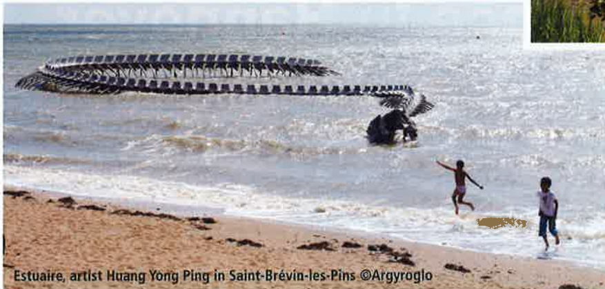
Estuaire, artist Huang Yong Ping in Saint-Brevin-les-Pins

Ever since 2007, installations created by internationally renowned artists in Nantes, Saint-Nazaire and along the banks of the river Loire, have led visitors to unusual sites. Whether in Nantes or Saint-Nazaire, Estuaire provides you with the opportunity to stroll around and discover the historic and contemporary heritage of both cities. On the estuary, discover the beauty of the Loire river and the diversity of the surrounding landscapes, rich wildlife preserves rub shoulders with gigantic industrial buildings and maritime heritage. Discovering the installations by the land will not only give you the opportunity to get a close look at the artworks, but also will make you feel the unique spirit of the estuary.